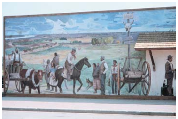
“The Carlton Trail” One of 11 murals in Duck Lake