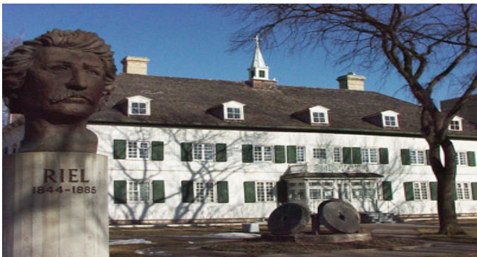
St. Boniface Museum, Winnipeg

Did you know...Manitoba will be celebrating "Homecoming" in 2010...starting with Louis Riel Day February 18th, 2010...Manitoba has chosen to name this civic holiday as Louis Riel Day instead. A number of winter festivals have been planned including Festival du Voyageur in Winnipeg and the Trappers Festival in and around The Pas.