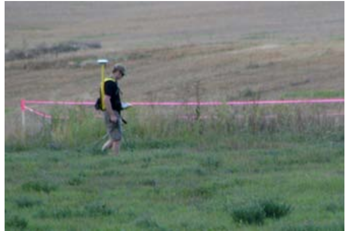
Archaeological survey work done this past summer at Fort Pitt.

This next 18 months will be a very busy time for the Parks Service staff in TPCS as we work to finalize the developments for Fort Pitt's upgrades and prepare to complete the same types of changes at Steele Narrows and Fort Carlton Provincial Parks.