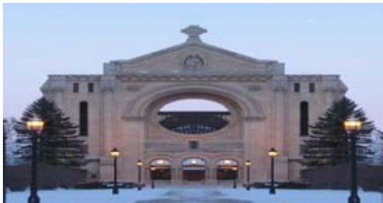
Saint Boniface Cathedral, Winnipeg

Did you know...Manitoba will be celebrating "Homecoming" in 2010...starting with Louis Riel Day February 18th, 2010...Manitoba has chosen to name this civic holiday as Louis Riel Day instead. A number of winter festivals have been planned including Festival du Voyageur in Winnipeg and the Trappers Festival in and around The Pas.