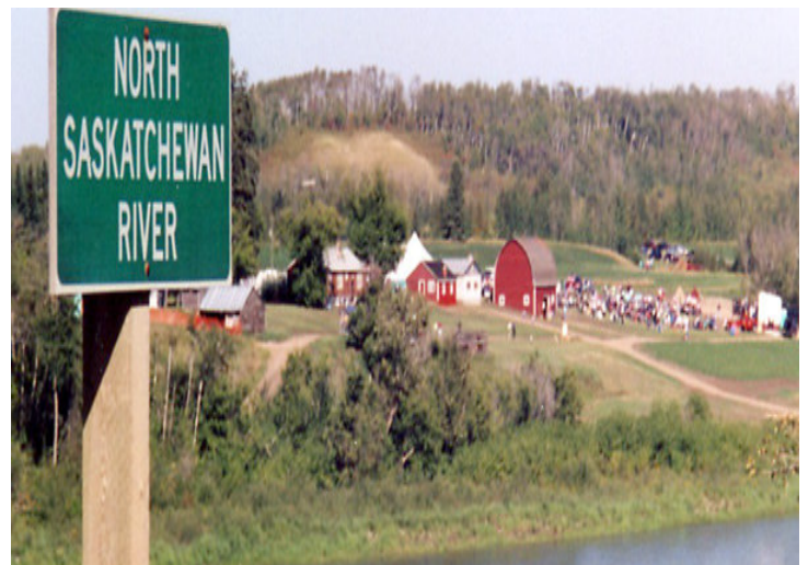
Métis Crossing, Alberta

As well, Métis Crossing has recently installed a zip-line and will be doing upgrades to their location. Saddle Lake First Nations is working on developing lake-side camping. Cold Lake First Nations is looking at developing a cultural centre at their traditional winter campsite.