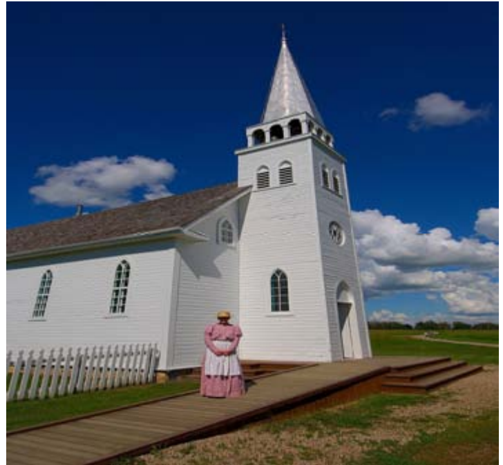
Batoche National Historic Site