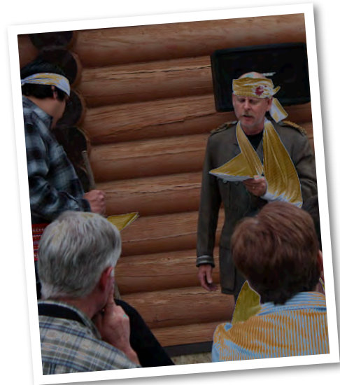
'ghosts' of 1885 speak to a fascinated audience

sincerely touched by the story shared in the play presented. Organizers have said from the beginning that it is the ancestors of today who need to know their own family stories and to recognize that all are part of the greater story of Canada's North West.